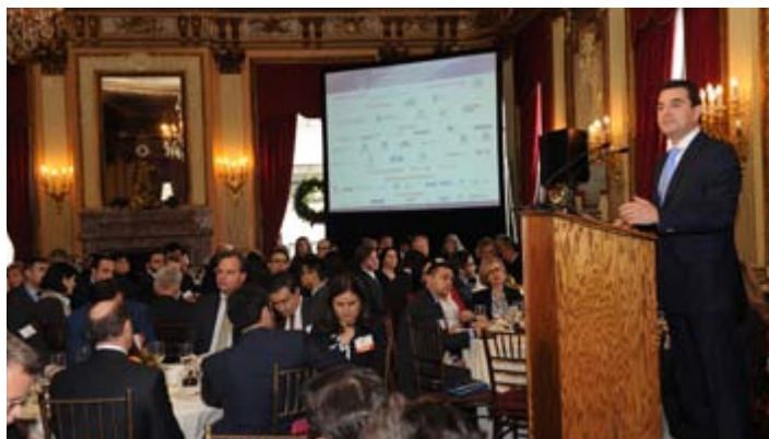
Hon. Constantine Skrekas, Greek Minister of Development and Competitiveness

expected to achieve positive economic growth for the first time after 6 years of recession. The last years of painful and rigorous reforms were rewarded by the capital markets, as depicted by the successful equity raisings of the Greek Banks and the Hel-