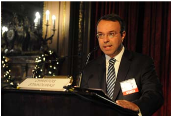
Hon. Christos Staikouras, Alternate Minister of Finance of the Hellenic Republic