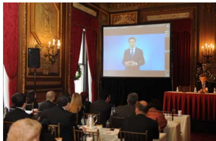
Mr. Jyrki Katainen, Vice President European Commission, Speech via webcast