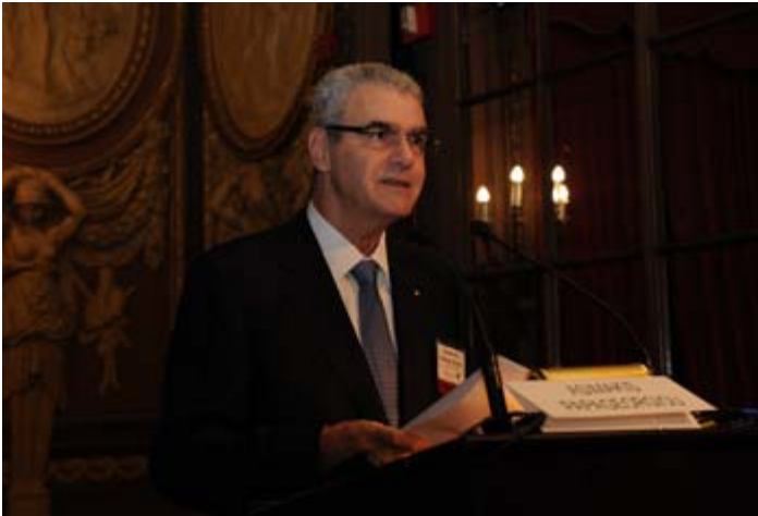
Hon. Asimakis Papageorgiou, Deputy Minister - Environment, Energy & Climate Change of the Hellenic Republic

determination and caution, because the last two years acquired with the effort and sacrifice for the stability and growth prospects of Greece and this effort cannot be wasted for any reason. Greece is definitely an integral part of Europe and the Eurozone. Greece is finally on the road stability, Recovery and Development”.