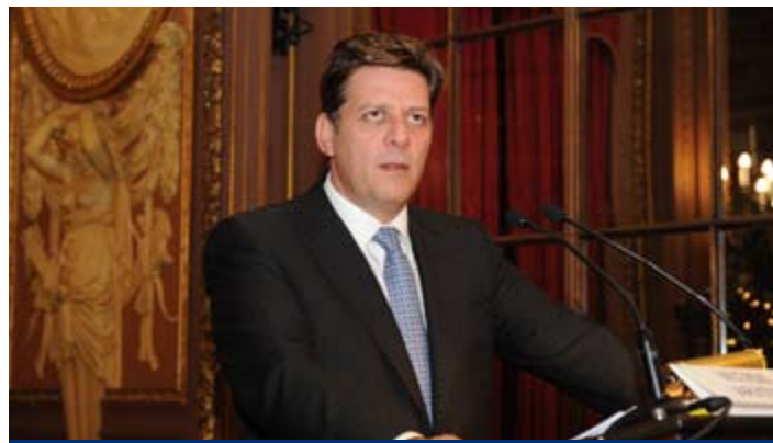
Hon. Miltiadis Varvitsiotis, Minister of Shipping, Maritime Affairs & the Aegean, Hellenic Republic