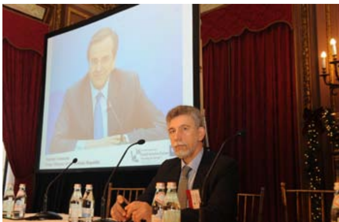
H.E. Antonis Samaras, Prime Minister of the Hellenic Republic, Speech via webcast