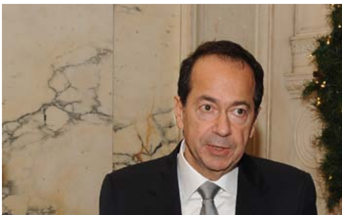
Mr. John Paulson, President & Portfolio Manager, Paulson & Co. Inc.